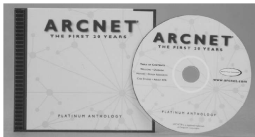
20-year anniversary ARCNET CD