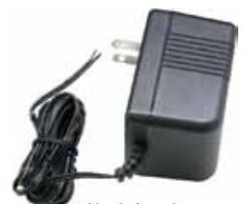
North American transformer shown